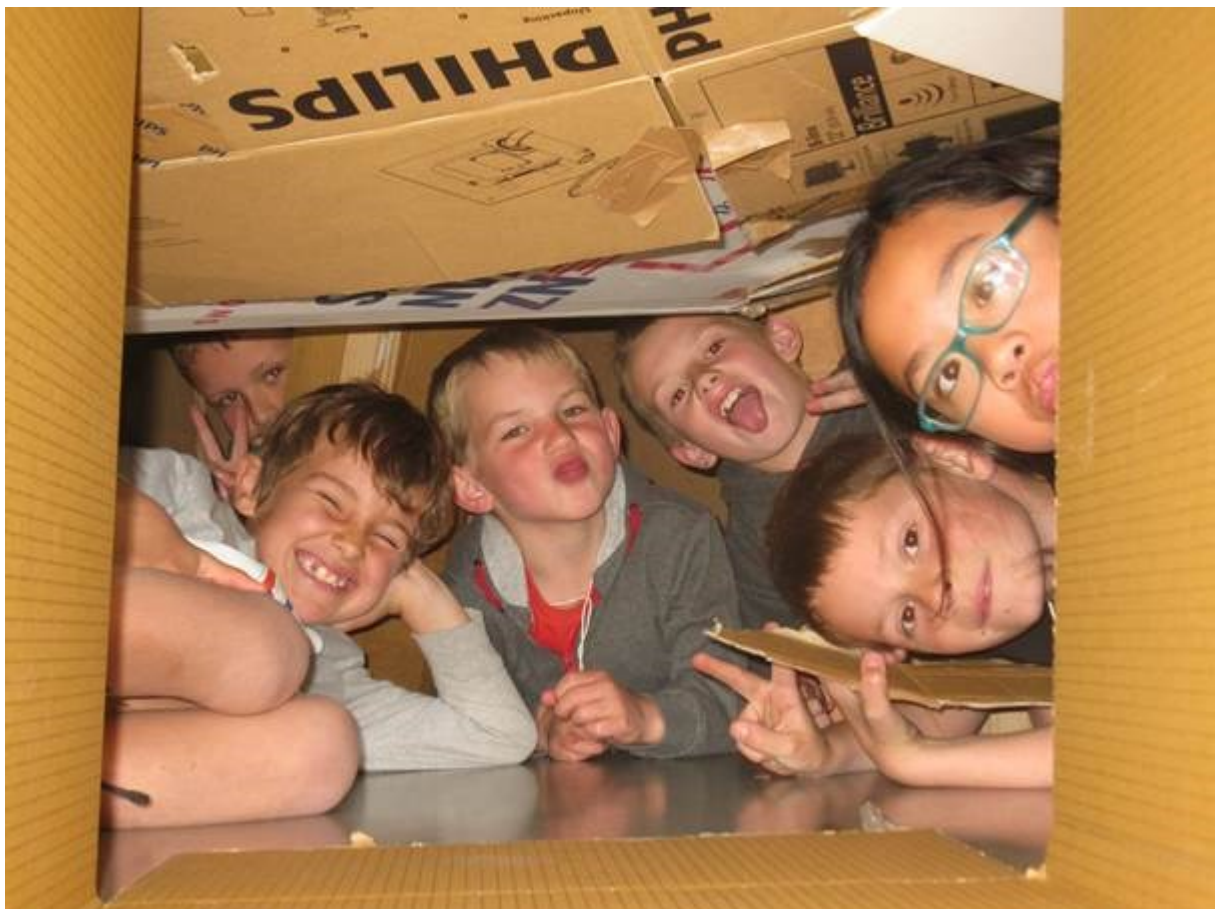
(A snap shot of the great fun we had last school holidays – Air Raid Shelter)

Bookings Essential: Please contact the Public Programmes Team on 03 343 9504 or email programmes@airforcemuseum.co.nz