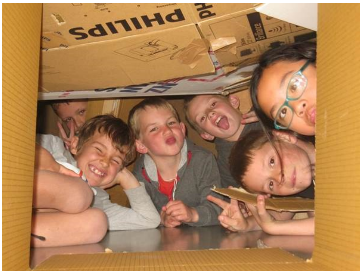
(A snap shot of the great fun we had last school holidays – Air Raid Shelter)

Bookings Essential: Please contact the Public Programmes Team on 03 343 9504 or email programmes@airforcemuseum.co.nz